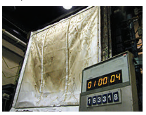
Flamestop FSI undergoing fire test at Bodycote Warrington Fire

QBM, Unit 5C, Grange Avenue, Baldoyle Ind. Est., Baldoyle, Dublin 13.