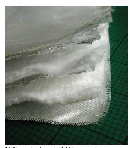
3 foil layers interleaved with high temperature